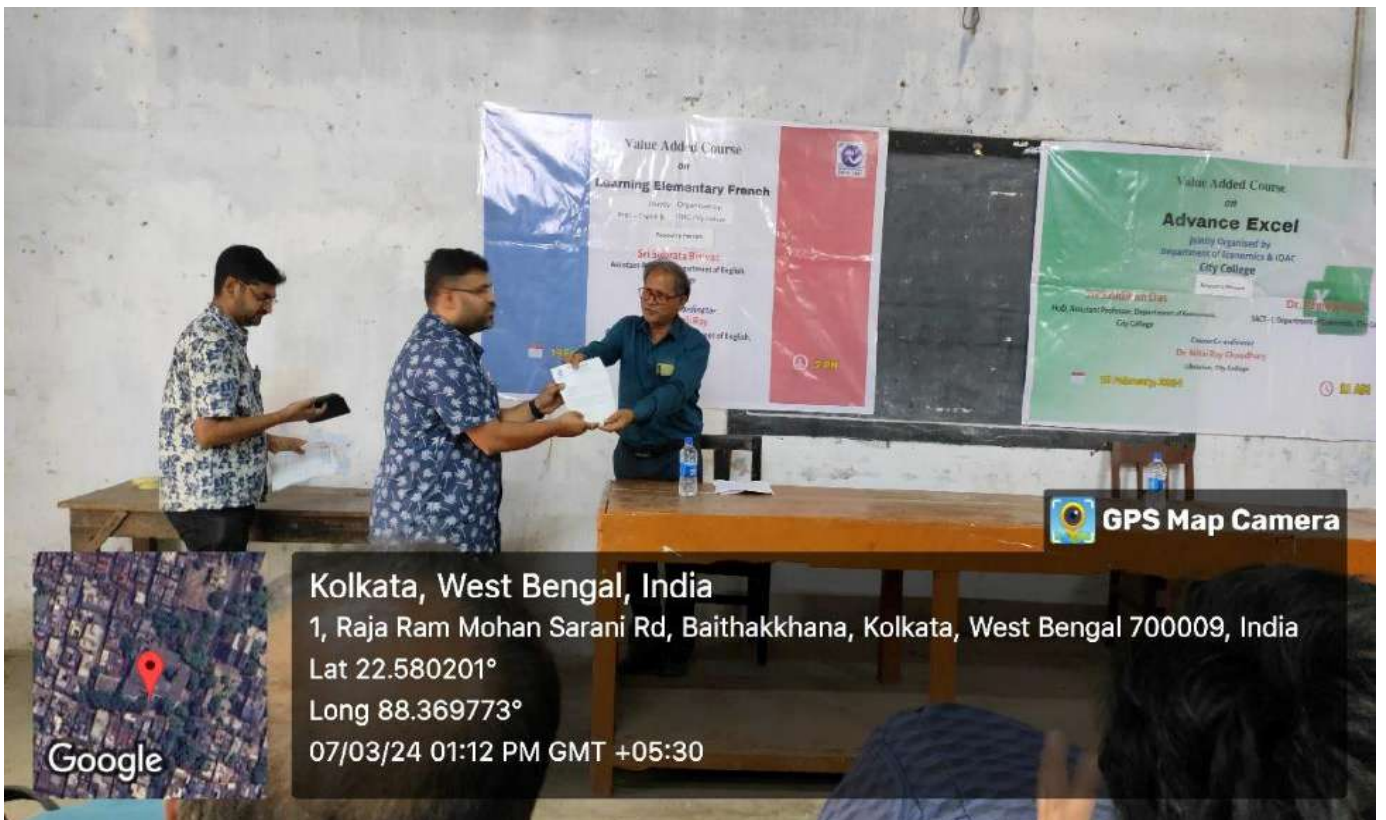
Kolkata, West Bengal, India 1, Raja Ram Mohan Sarani Rd, Baithakkhana, Kolkata, West Bengal 700009, India Lat 22.580201° Long 88.369773° 07/03/24 01:12 PM GMT +05:30