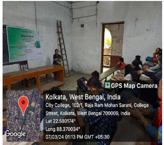
Kolkata, West Bengal, India City College, 102/1, Raja Ram Mohan Sarani, College Street, Kolkata, West Bengal 700009, India Lat 22.580174° Long 88.370034° 07/03/24 01:13 PM GMT +05:30