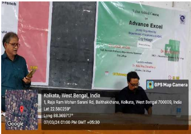
Kolkata, West Bengal, India 1, Raja Ram Mohan Sarani Rd, Baithakkhana, Kolkata, West Bengal 700009, India Lat 22.580259° Long 88.369717° 07/03/24 01:00 PM GMT +05:30