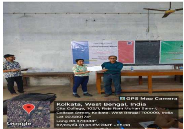
Kolkata, West Bengal, India City College, 102/1, Raja Ram Mohan Sarani, College Street, Kolkata, West Bengal 700009, India Lat 22.580174° Long 88.370034° 07/03/24 01:21 PM GMT +05:30