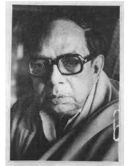
Debiprasad Chattopadhyay Philosopher