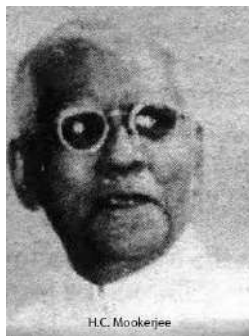
Harendra Kumar Mukherjee Former Governor of West Bengal