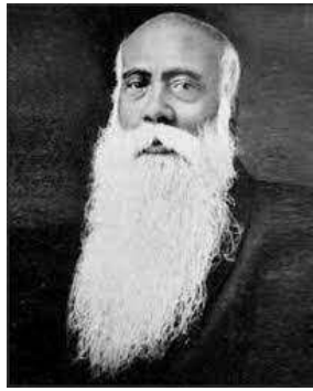
Acharya Brajendranath Sil Polymath