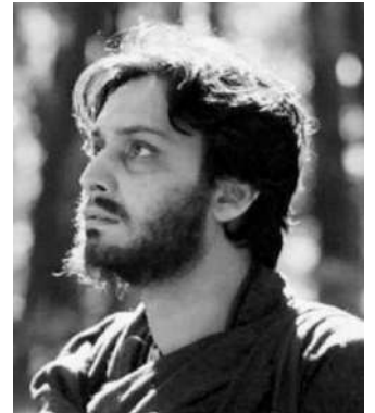
Soumitra Chattopadhyay Performing artist, poet, editor