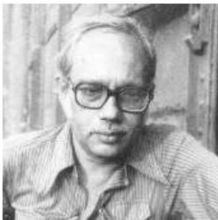
Shakti Chattopadhyay Bengali poet