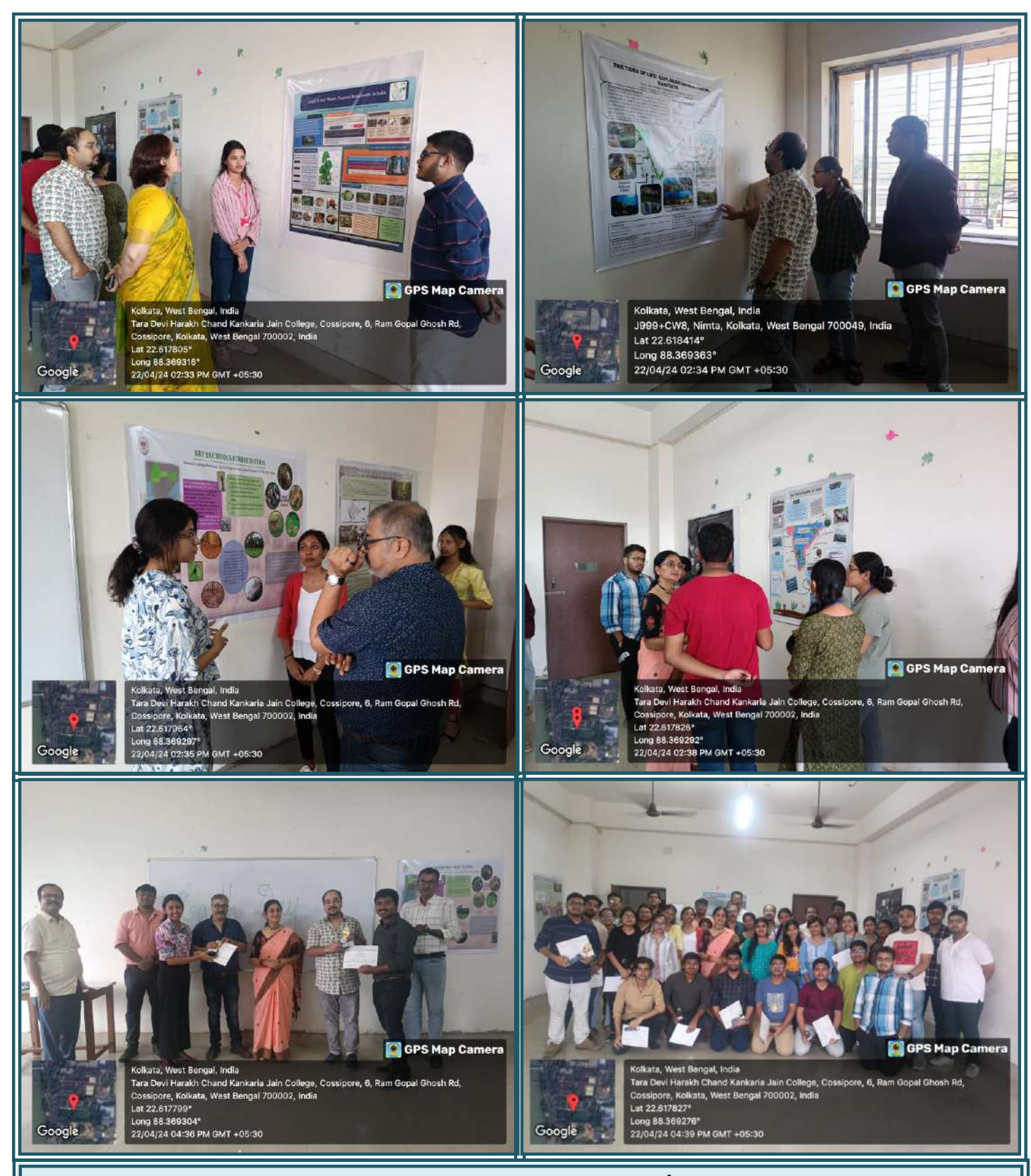
Some Glimpses of The Earth Day Celebration on 22<sup>nd</sup> April, 2024, jointly by the Departments of Zoology, City College, Kolkata and THK Jain College, Kolkata