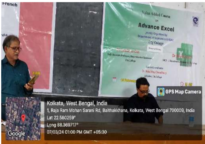
Kolkata, West Bengal, India 1, Raja Ram Mohan Sarani Rd, Baithakkhana, Kolkata, West Bengal 700009, India Lat 22.580259° Long 88.369717° 07/03/24 01:00 PM GMT +05:30