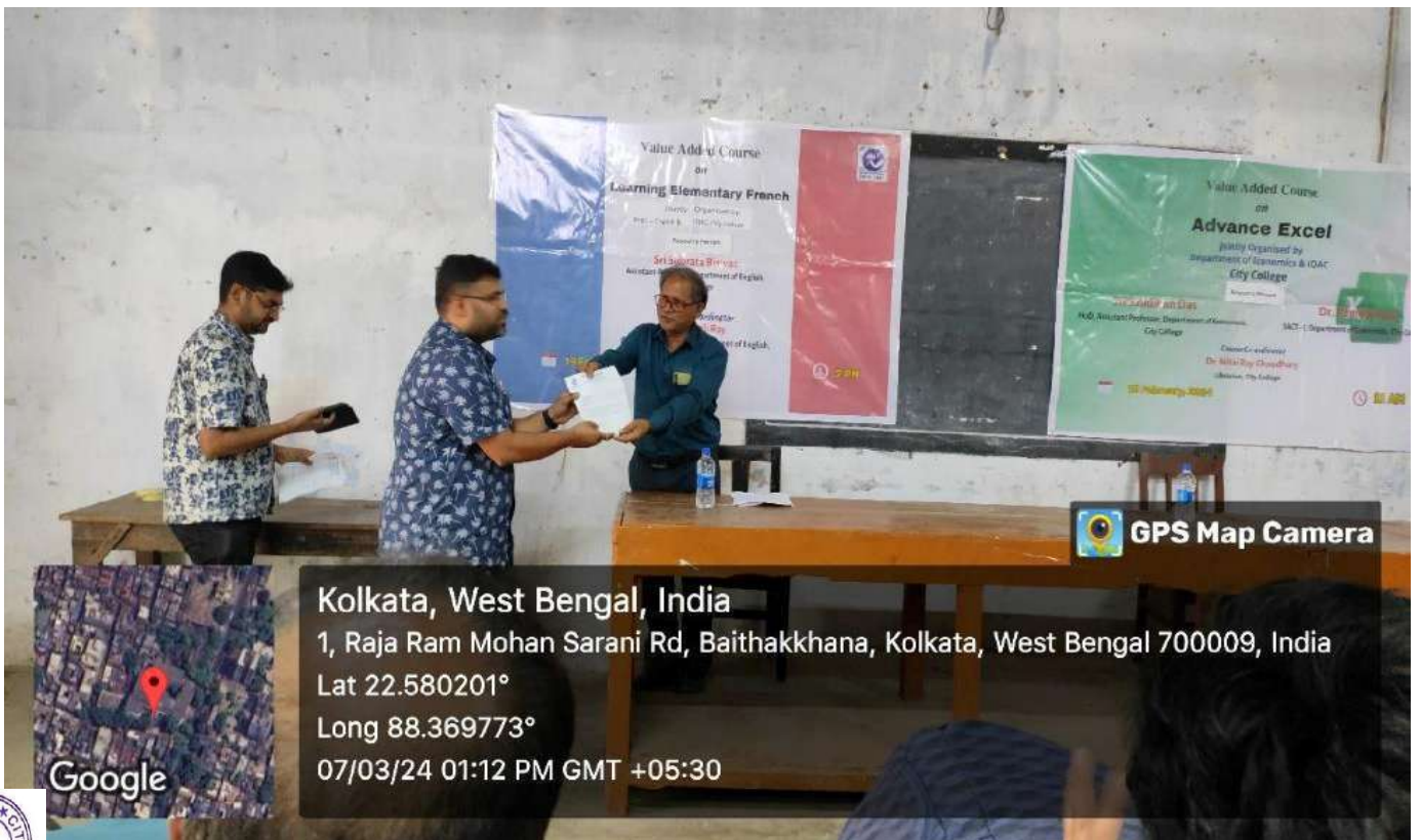
Kolkata, West Bengal, India 1, Raja Ram Mohan Sarani Rd, Baithakkhana, Kolkata, West Bengal 700009, India Lat 22.580201° Long 88.369773° 07/03/24 01:12 PM GMT +05:30