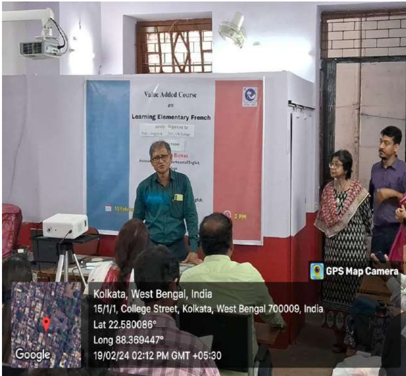
Kolkata, West Bengal, India 15/1/1, College Street, Kolkata, West Bengal 700009, India Lat 22.580086° Long 88.369447° 19/02/24 02:12 PM GMT +05:30