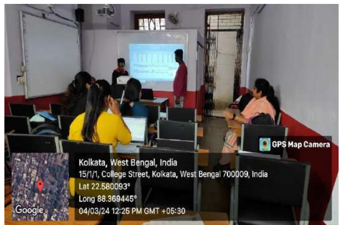
Kolkata, West Bengal, India 15/1/1, College Street, Kolkata, West Bengal 700009, India Lat 22.580093° Long 88.369445° 04/03/24 12:25 PM GMT +05:30