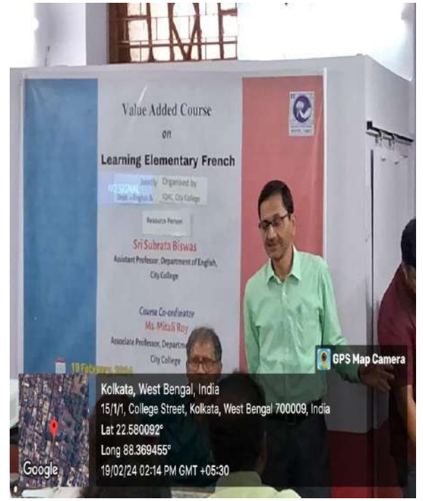
Kolkata, West Bengal, India 15/1/1, College Street, Kolkata, West Bengal 700009, India Lat 22.580092° Long 88.369455° 19/02/24 02:14 PM GMT +05:30