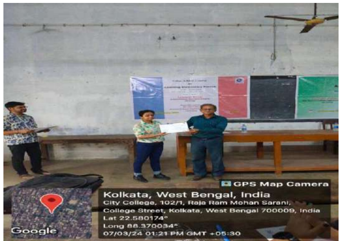
Kolkata, West Bengal, India City College, 102/1, Raja Ram Mohan Sarani, College Street, Kolkata, West Bengal 700009, India Lat 22.580174° Long 88.370034° 07/03/24 01:21 PM GMT +05:30