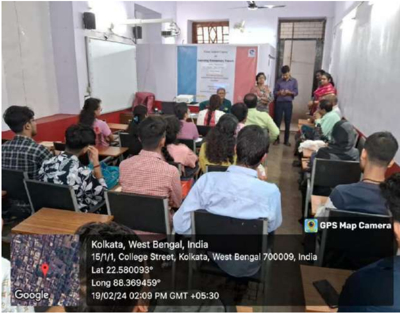
Kolkata, West Bengal, India 15/1/1, College Street, Kolkata, West Bengal 700009, India Lat 22.580093° Long 88.369459° 19/02/24 02:09 PM GMT +05:30