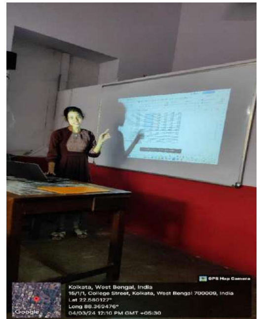
Kolkata, West Bengal, India 15/1/1, College Street, Kolkata, West Bengal 700009, India Lat 22.580127° Long 88.369476° 04/03/24 12:10 PM GMT +05:30