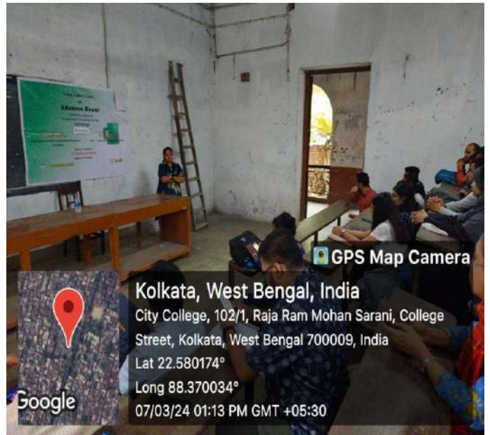
Kolkata, West Bengal, India City College, 102/1, Raja Ram Mohan Sarani, College Street, Kolkata, West Bengal 700009, India Lat 22.580174° Long 88.370034° 07/03/24 01:13 PM GMT +05:30