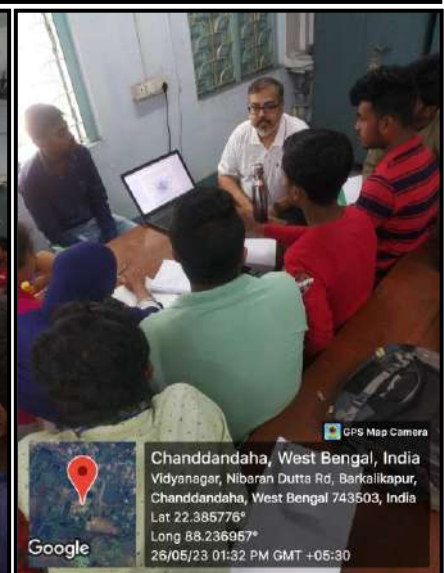
Some Glimpses of "One Day Workshop on Chronobiology" at Department of Zoology, Vidyanagar College, Amtala, 24 PGs (South), West Bengal, India