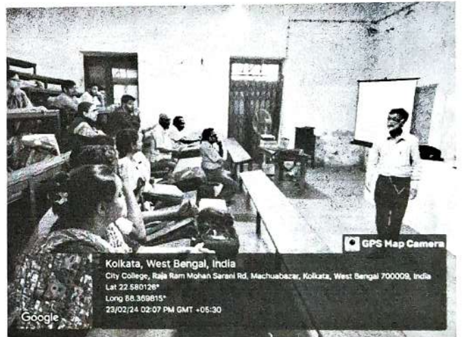
Kolkata, West Bengal, India City College, Raja Ram Mohan Sarani Rd, Machubazar, Kolkata, West Bengal 700009, India Lat 22.580126° Long 88.369815° 23/02/24 02:07 PM GMT +05:30