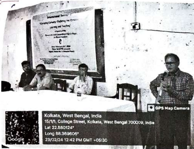
Kolkata, West Bengal, India 15/1/1, College Street, Kolkata, West Bengal 700009, India Lat 22.580124° Long 88.369606° 23/02/24 12:42 PM GMT +05:30