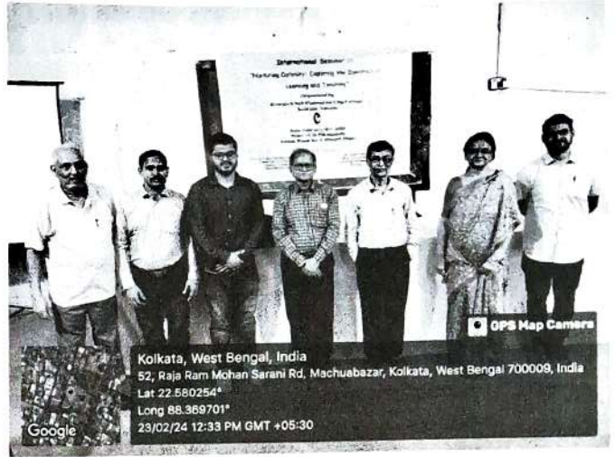
Kolkata, West Bengal, India 52, Raja Ram Mohan Sarani Rd, Machubazar, Kolkata, West Bengal 700009, India Lat 22.580254° Long 88.369701° 23/02/24 12:33 PM GMT +05:30