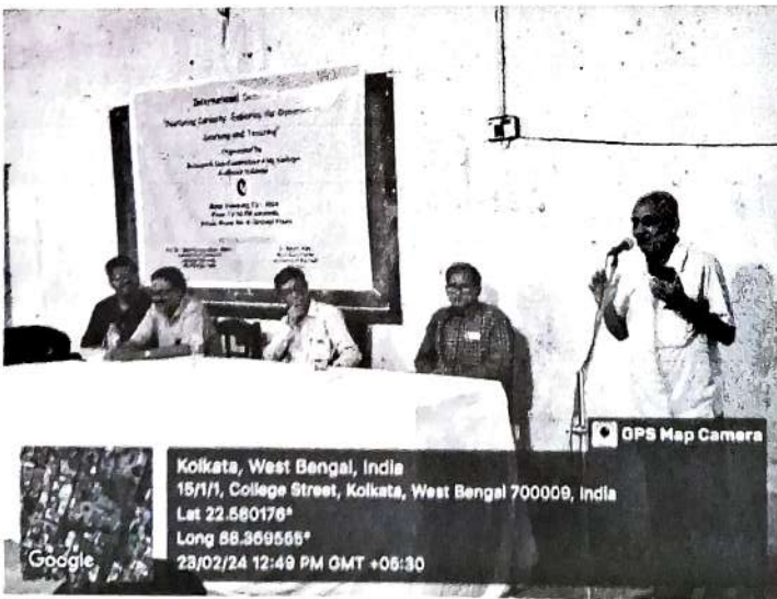
Kolkata, West Bengal, India 15/1/1, College Street, Kolkata, West Bengal 700009, India Lat 22.580178° Long 88.369555° 23/02/24 12:49 PM GMT +05:30