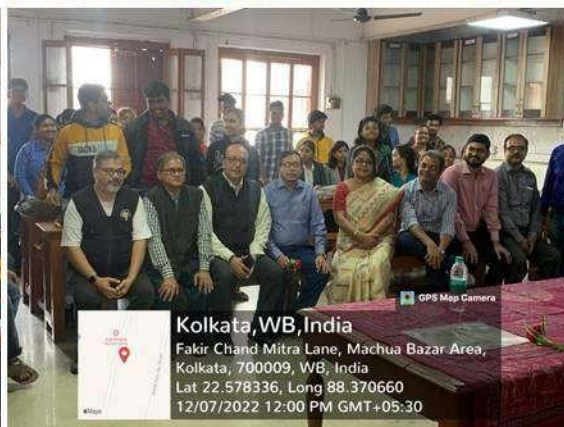
Figure Plate 1: Glimpses of the inaugural ceremony of the Workshop