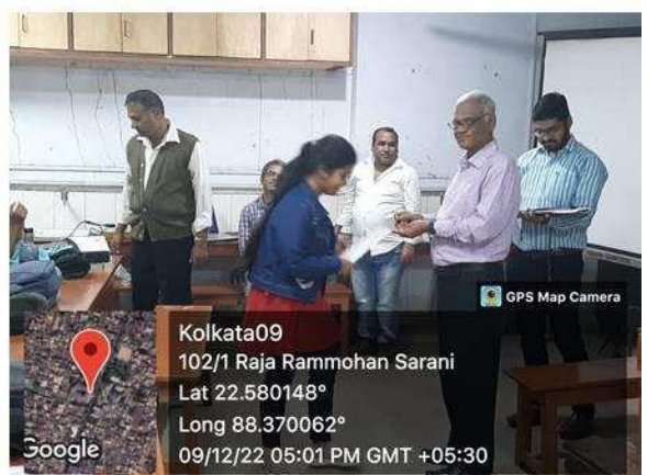
Figure Plate 2: Glimpses of the Workshop